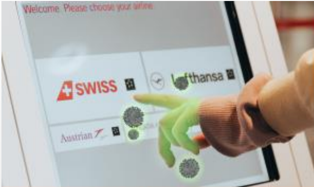
UNTREATED TOUCH DISPLAY

Researchers at CSIRO, Australia's National Science Agency, have found that SARS-CoV-2, the virus responsible for COVID-19, can survive for up to 28 days on common surfaces including glass found on touch screens