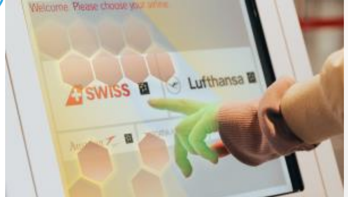
NANOSHIELD PROTECTED DISPLAY